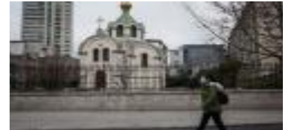
Thousands of pastors go into hiding amid China’s rising persecution, attempts to eradicate Christianity

Is there a difference between the “letter of the law” and the “spirit of the law?”