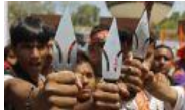
Hindus beat pastor in India, threaten to sacrifice him to false god over Bible tracts